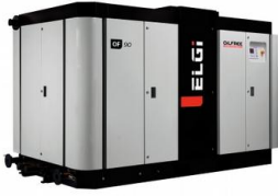
Oil-Free Series Screw 90 - 450 kW / 480 - 2515 cfm