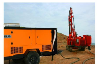
High pressure compressor for crawler drilling