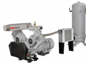
Oil-free Recip 1.0 - 75 HP / 1.8 - 300 cfm