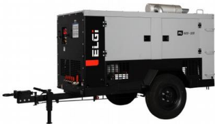
Diesel portable (Trolley) 185 - 1100 cfm / 100 - 300 psi