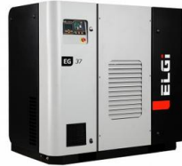
EG Series Rotary Screw 11 - 250 kW / 47 - 1612 cfm