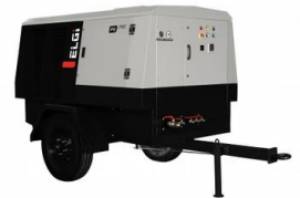
Electric Portable (Trolley) 22 - 75 kW / 131 - 490 cfm