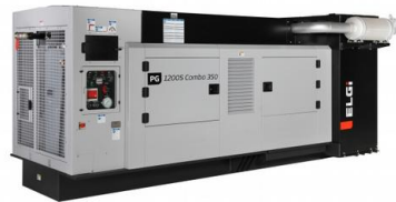
Diesel Portable (Skid) 475 - 1500 cfm / 150 - 400 psi