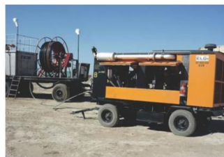
Uranium hole blowing