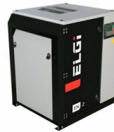
EN Series Rotary Screw 2.2 - 75 kW / 8.0 - 469 cfm