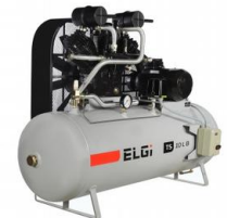
Oil-lubricated Recip 1.0 - 40 HP / 2.0 - 128 cfm