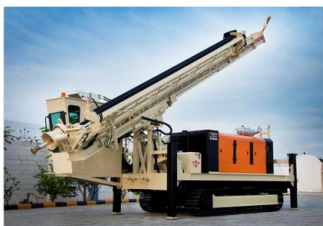
Blast hole drilling