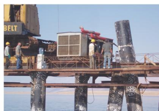
Mining in dead sea